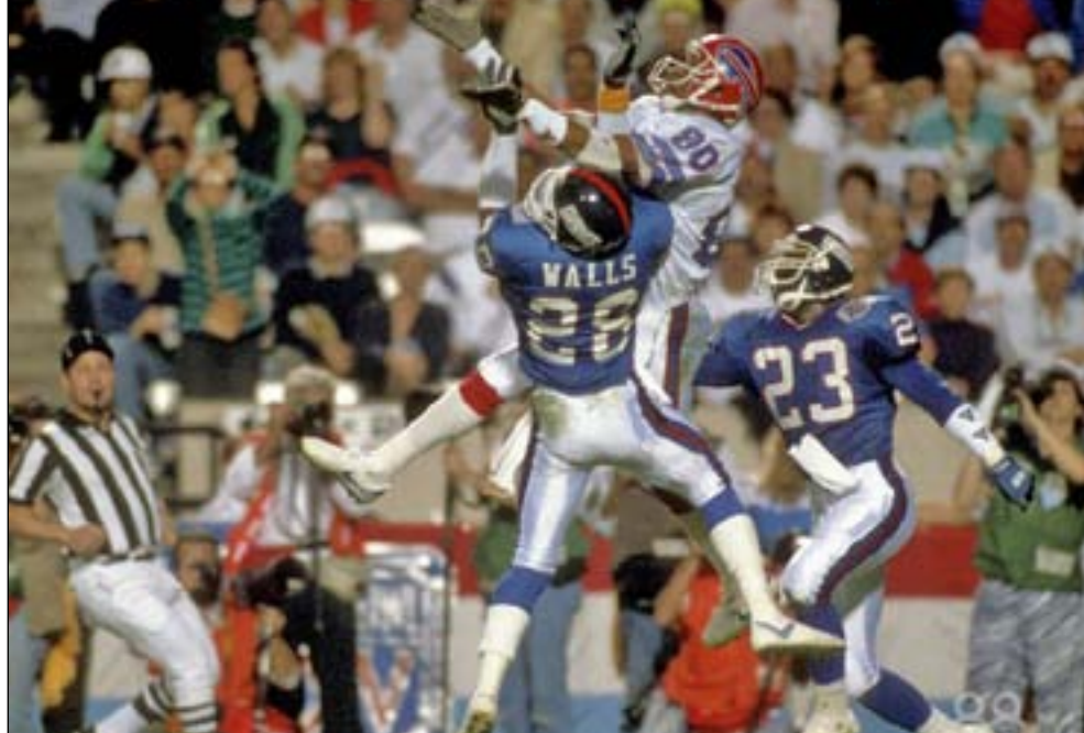
JUMP BALL: New York Giants defensive back Everson Walls (#28, Grambling) defends Buffalo Bills receiver James Lofton (80) after a 61-yard pass during Super Bowl XXV at Tampa Stadium. The Giants defeated the Bills 20-19.

KEY FACTS: As a testament to the closeness of Super Bowl XXV, Buffalo totaled 371 yards and New York had 388. The Bills rushed for 166 yards and the Giants had 172. Buffalo passed for 205 and New York passed for 214. There were no turnovers, no interceptions and no fumbles that changed hands.