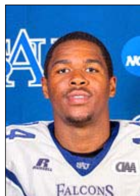
St. Augustine's Sports Photo