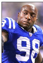
Robert Mathis Indianapolis Alabama A&M