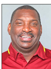
Washington Photo Doug Williams NFL Personnel Exec Grambling State

Continuing a recent trend, the MEAC has by far the most players in the league among HBCU conferences with 18. Just six hail from the Southwestern Athletic Conference, the league that historically placed the most players in the league. South Carolina State tops this year's list with six players on NFL rosters. Two other