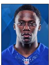
Indianapolis Colts Photo