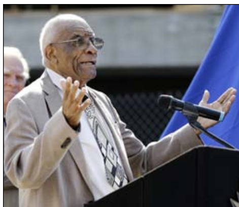
Former Tennessee State and Olympic women's track coach Ed Temple speaks during the dedication of his statue in Nashville in 2015

Legendary track and field coach Ed Temple passed away late Thursday evening (Sept. 21) at the age of 89.