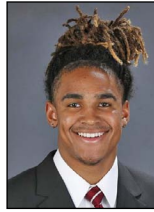
Jalen Hurts Alabama