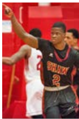
Shaw Sports Photo