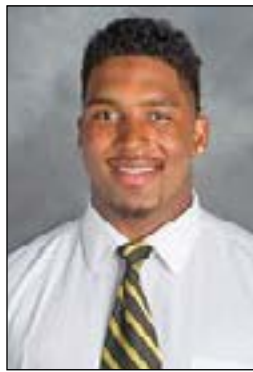
Alabama State Photo