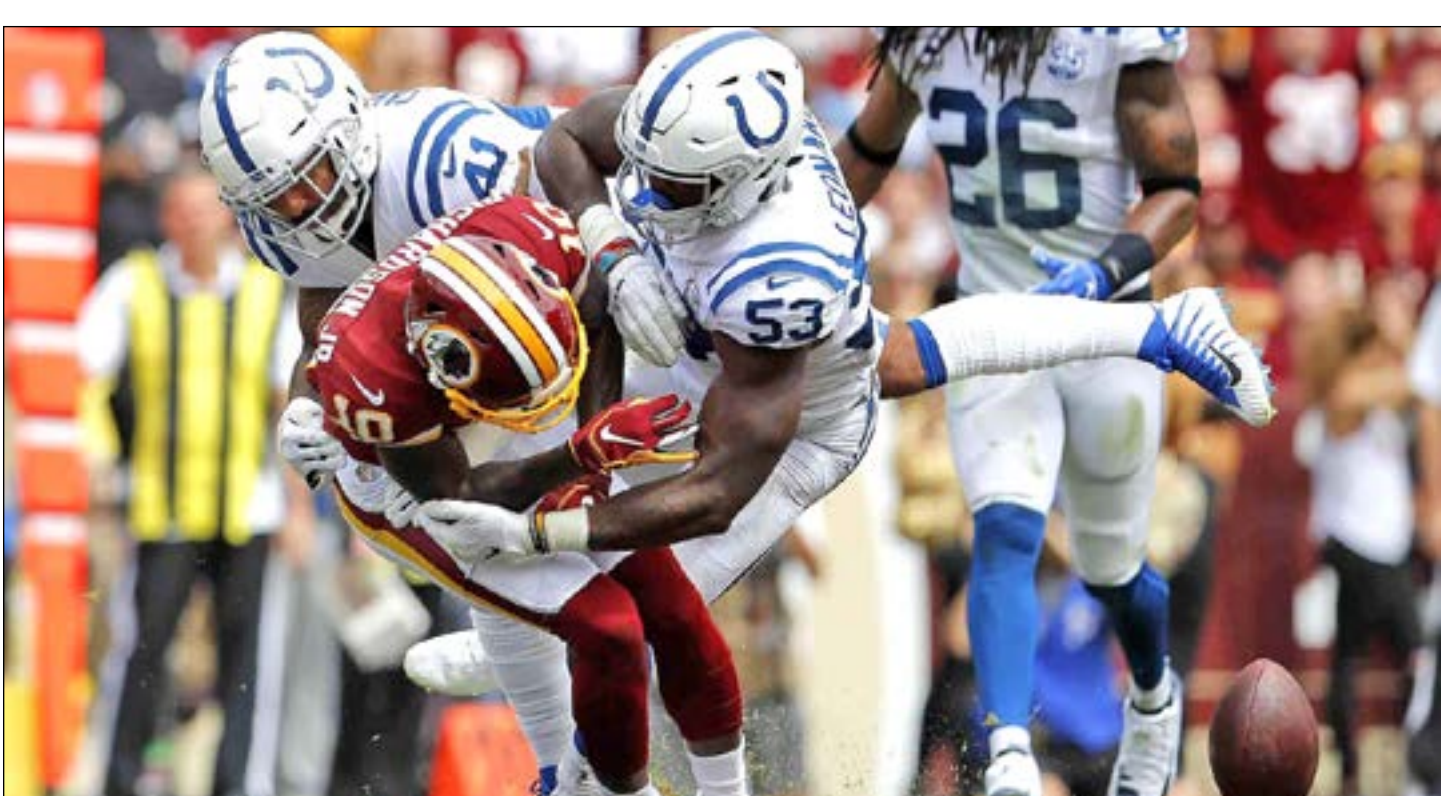
FUMBLE!!!: Indianapolis Colts rookie linebacker DARIUS LEONARD (53, SOUTH CAROLINA STATE ) hits and shakes the ball loose from Washington wide receiver Paul Richardson Jr. in the Colts' win over the 'Skins Sunday. Leonard has led the 1-1 Colts in tackles in both their games.

https://www.colts.com/news/darius-leonard-introduces-himself-to-the-national-football-league