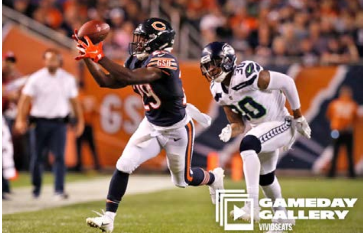
GIMME THAT!!!: Chicago Bears running back TARIK COHEN (#29, NORTH CAROLINA A&T ) hauls in a 17-yard pass from QB Mitch Trubisky in the second quarter of Monday night's game vs. Seattle. Cohen had 83 all-purpose yards as the Bears best the Seahawks, 21-17. From Chicago Bears Gameday Gallery