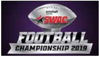
SWAC Title Game logo