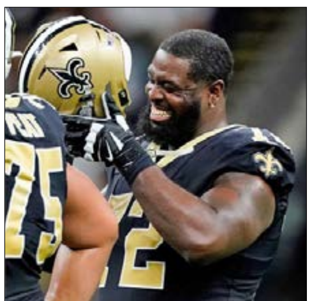
ROAD GRADER!!: New Orleans left offensive tackle TERRON ARMSTEAD (#72, ARKANSAS-PINE BLUFF ) shows his pass blocking form (l.) and smiles after his team's work in their 31-9 win over Arizona. The Saints totalled over 500 yards of total offense.