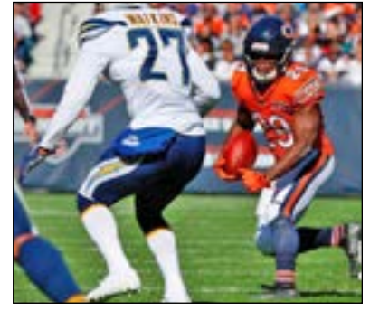
SUNDAY STARS!!: New Orleans left offensive tackle TERRON ARMSTEAD (l., #72), Indianapolis linebacker DARIUS LEONARD (top r., #53) and TARIK COHEN (bottom r., #29) get Week 8 Player of the Week honors.