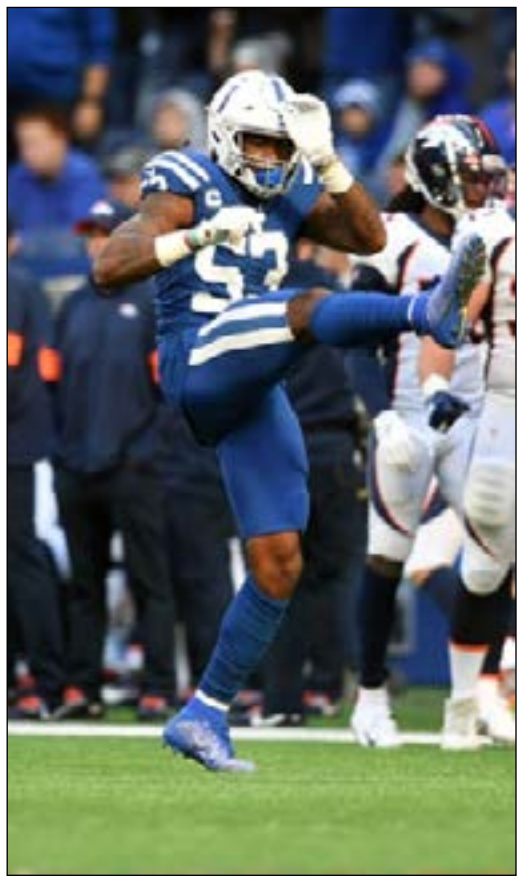
SACK & CELEBRATION!!: (From indianapoliscolts.com) Indianapolis linebacker DARIUS LEONARD (#53, SOUTH CAROLINA STATE ) takes a ride on the back of Denver quarterback Joe Flacco during Sunday's 15-13 Colts win, and then celebrates the accomplishment. Leonard led the Colts with ten tackles, six solos.