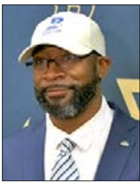
Bluefield State Sports Photo