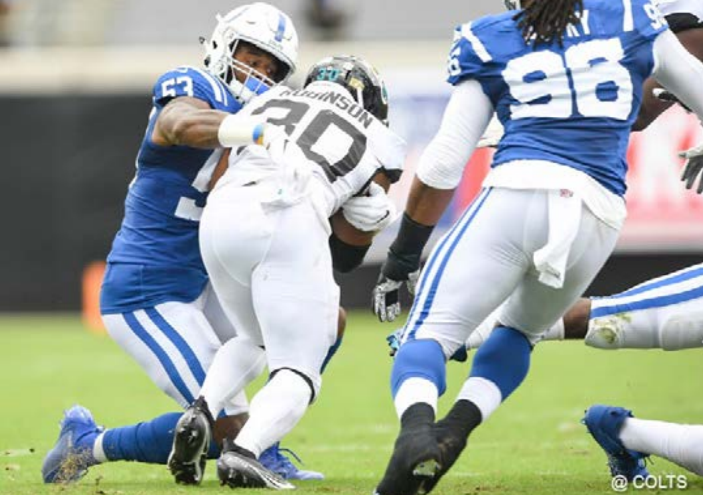
DOING WHAT HE DOES!: (Above) Indianapolis third-year all-pro linebacker DARIUS LEONARD (53, SOUTH CAROLINA STATE) grabs Jacksonville linebacker JAMES ROBINSON (#30) in Sunday's game in Jacksonville, Fla. Leonard led Indy with nine tackles, four of them solos like this one, in the Colts' loss to the Jaguars. (Below) Leonard stares down Jacksonville quarterback Gardner Minshew and is poised to strike before the Jags' play.