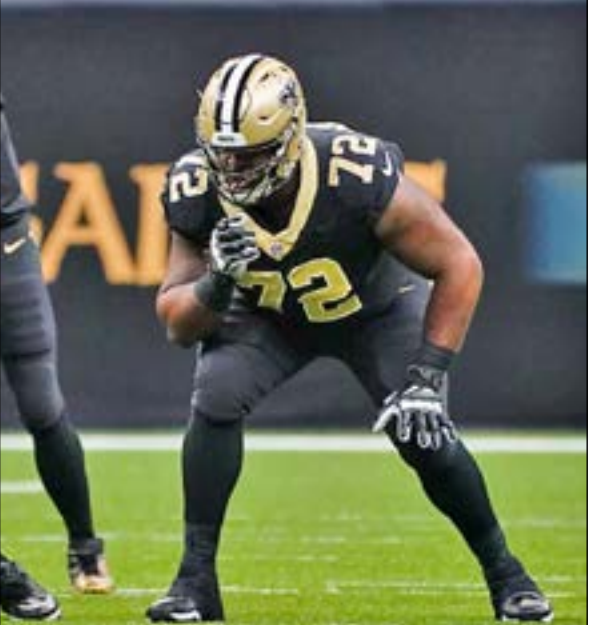
New Orleans all-Pro left offensive tackle Terron Armstead (#72, ARKANSAS-PINE BLUFF)