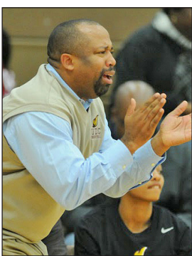
Virginia Union Sports Photo